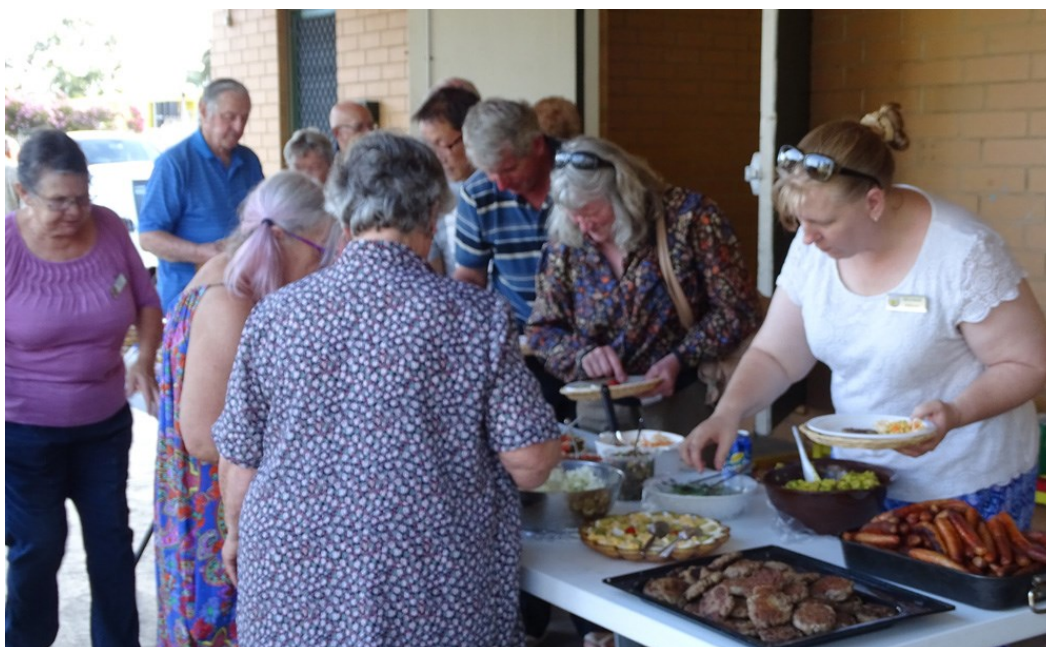
Members enjoying the Barbeque at the January Fun Night